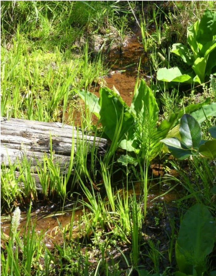
Shallow wet areas with Sedges & Skunk Cabbage

Conservation ownership means not only that the complete protection, but also all possible day to day research and monitoring activities, are directly overseen by DCA. Also, the former owners are relieved of their covenant and property oversight on those acres. The Danes Creek wetland area was first noted by the international ecologist Dr. Chris Pielou as a significant Western redcedar, skunk cabbage swamp. At that time a remarkable overstory tree-canopy spread above, while among the trees-roots were curious pockets of wetland plants, particularly skunk cabbage.