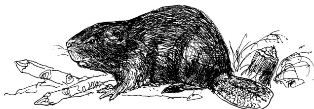
Beaver: one of our favourite Denman Isl. wild residents