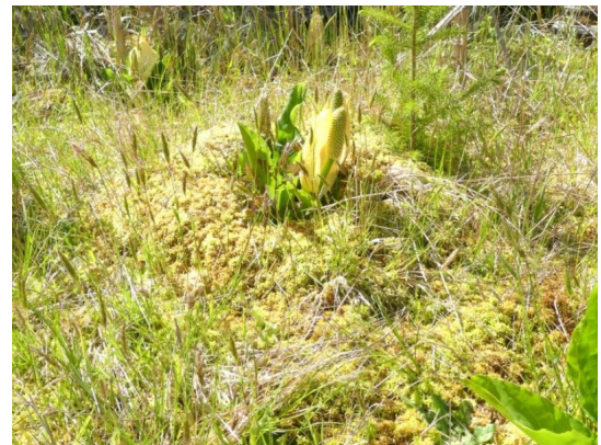
Growing Sphagnum moss surrounding skunk cabbage

With the changing climate, the area's future ecological development is unknown, but if our Western redcedar trees do survive into the future, this wetland may well be one of their sanctuaries. Biologists will observe this sensitive area carefully over the coming years.