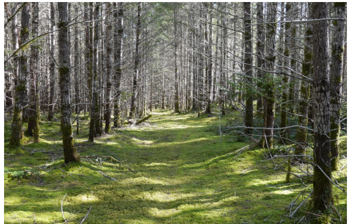
Old logging road through the Raven property