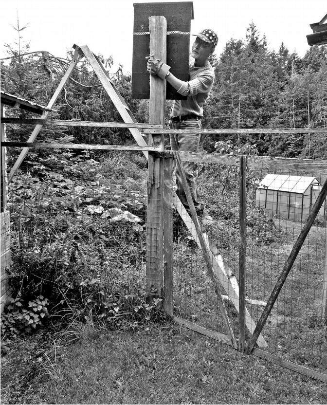
Installing a bat house...see Page 4

Also in keeping with the theme, for this year's Home and Garden Tour, the DCA Central Park Committee will host a tour stop and guided walks at Central Park, highlighting Graveyard Marsh and the Swale, two unique and important wetlands. More to come... stay tuned!