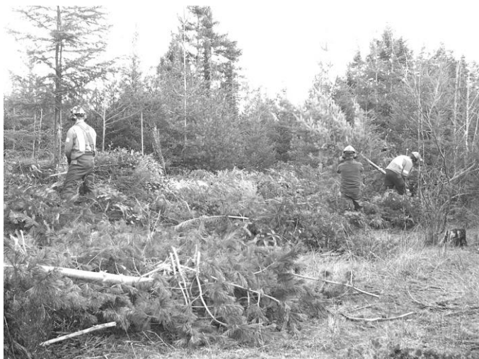
Above & Beyond Tree Service fallers at work in the Settlement Lands

A current membership is required in order to vote on DCA society matters. Volunteers will be available before the meeting commences to accept a minimum $10 donation from those who wish to renew their membership.