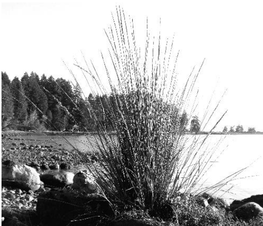
Pretty but so invasive!

The spring brings new growth and the DCA's Garry oak garden project will be checking to see how the mini-gardens are doing. We want to remind folks that any lawns, particularly on the shoreline, could be Garry oak meadows with open grassy space, lovely slow-growing deciduous oak trees and gorgeous spring meadow flowers to enliven the heart. By getting started and planting Garry oaks, we are learning what could work, where! Photos of these gardens and tips for Garry oak gardeners will be posted on the Conservancy's web site in May and June.