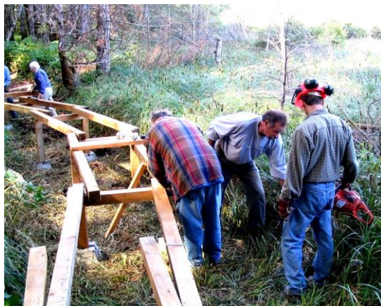
Work party at Winter Wren Wood

The concept is not new to Islands Trust. In its REGIONAL CONSERVATION PLAN 2005 – 2010 the Islands Trust Fund offered planners and Local Trust Committees its expertise to assist them in establishing a network of protected areas. The information provided by the Islands Trust Ecosystem Mapping (ITEM), created by Islands Trust Fund was identified in their Conservation Plan as essential for designing such networks.